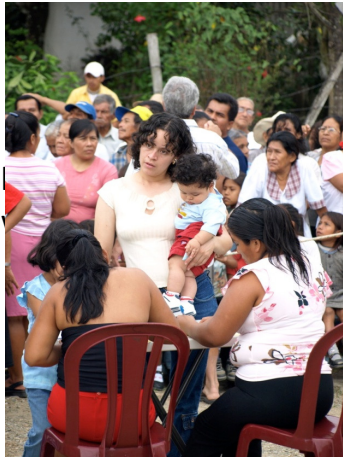
People we serve

West Hills has participated in missions with Faith in Practice since 2003. We have sent physicians, pharmacists, and translators on one-week missions for the past eight years. Last year Faith in Practice served over 20,000 patients.